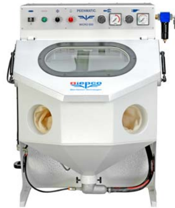
Tabletop Microblasting Equipment